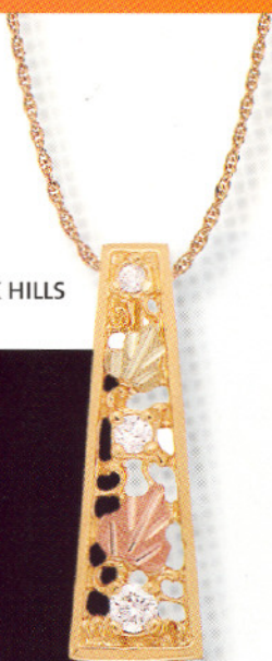
STAMPER BLACK HILLS GOLD JEWELRY